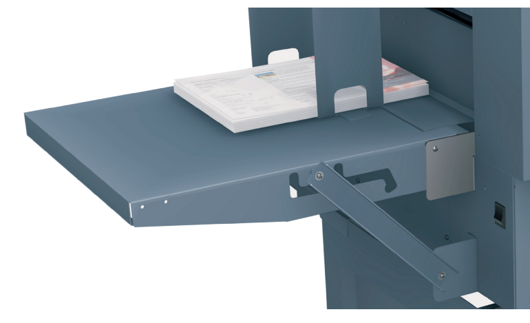
Switchable 4 or 8 belt feeding