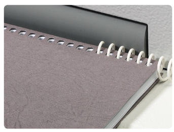
The simple to use rubber roller threads the coil through the document quickly and effectively.