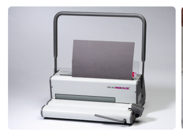
Vertical punching makes it quick and easy to punch correctly every time.