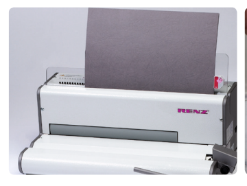
Vertical punching makes it quick and easy to punch correctly every time.