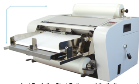
Just Push the Start Button and that's it. No need to stand over the laminator, loading

Totally autonomous operation utilising a unique lift and feed roller mechanism completely eliminates any chance of double feeding, even on difficult stock. The whole process is simple, load, enter batch quantity and press start, thats it!