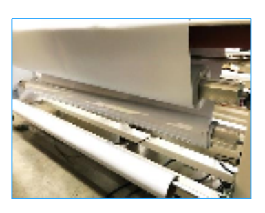
Re-winding system Optional shaft holder