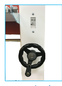
Easy operation handle - Roller clearance