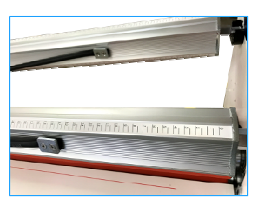
Easy film set new shaft - Light shaft with scale