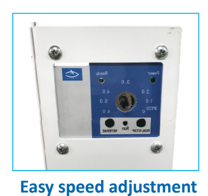
Dial system speed adjustment 0m~6.0m/min