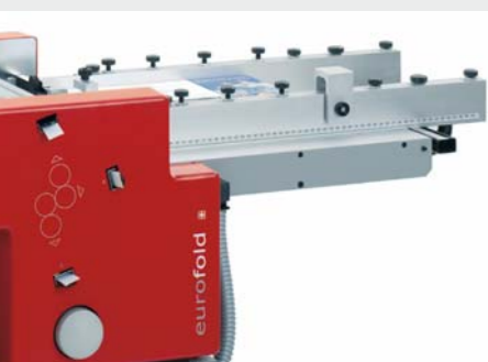
Suction feeder. High accuracy for the professional use.