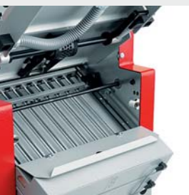
Accessibility to the lower folding plate.