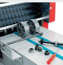
Scoring and perforating.

Multigraf AG Graphic Arts Machines Grindelstrasse 26 CH-5630 Muri Tel. +41 56 675 58 00 Fax +41 56 675 58 60 mail@multigraf.ch www.multigraf.ch