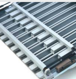
Detail of the automatic folding plate.

*Length including stream delivery 235.301 The technical dates can be changed at any time.