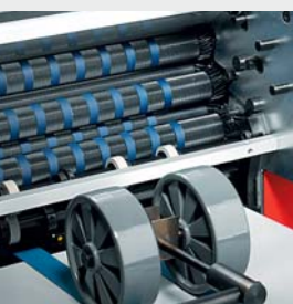
Steel-rubber rollers with diagonally toothed gears.