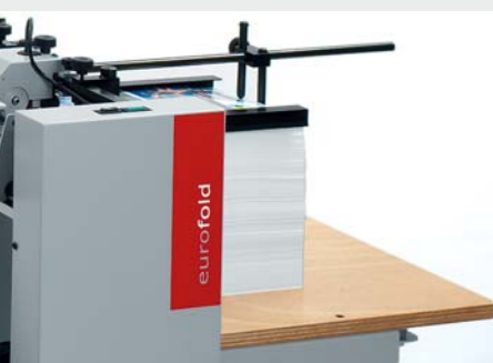
Deep pile feeder. To improve the productivity.