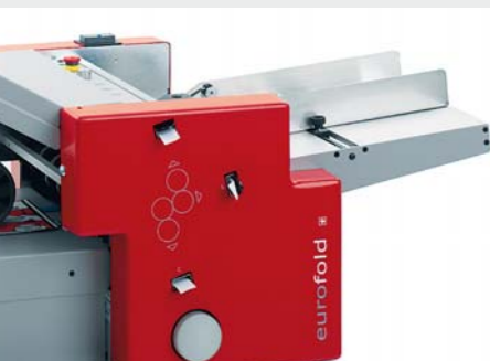
Friction feeder. For all A3-models.

In response to the needs of today, Eurofold offers the customised solution, and for the uses of tomorrow the ability to upgrade with other modules and new developments. The computer supported models offer extremely high user friendliness and can be adjusted to a new fold by the single touch of a button. Manual movements are almost eliminated. Recurring jobs can easily be stored in the memory.