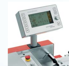
Preselect and spacer unit. Includes all necessary elements for counting, spacing and controlling.