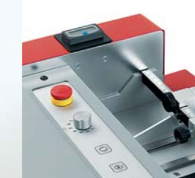
Total counter. The most effective possibility to control your job.