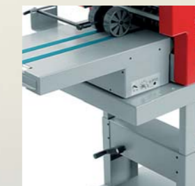
The height adjustable stand. For a versatile use of the Eurofold folding machines.