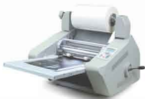
ENTRY LEVEL Exceltopic-380