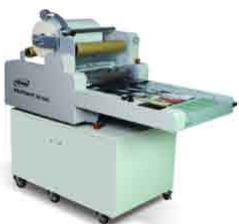
INDUSTRIAL Protopic Range