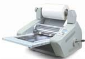
ENTRY LEVEL Exceltopic-380