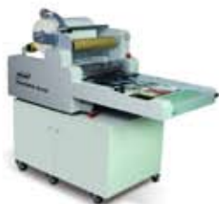
INDUSTRIAL Protopic Range