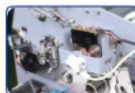
TEMPERATURE SENSOR INSIDE ROLLER