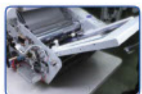
REMOVABLE FEEDING TABLE