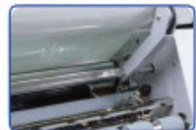
TOP AND IN-LINE PERFORATOR