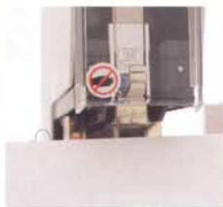
Loop stapling secures the sheets and ensures easy filing without making ugly punch holes. Brochures remain attractive, without any loss of text or pictures.