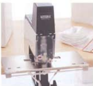
Flat stapling with the R106E. Automatic or pedal-controlled stapling to a depth of up to 100mm.