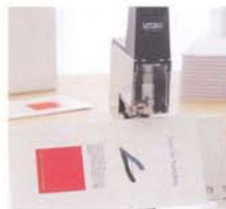
Saddle stapling with the R106E. Adjustable paper guide for precise stapling. Pedal-operating stapling.