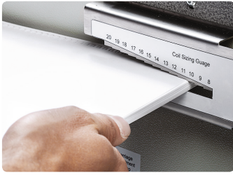
Built in coil sizing gauge.

The APSI 300 compact offers a built in coil sizing gauge to help the operator confirm the diameter of coil required in relation to the book thickness.