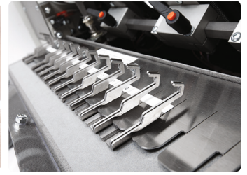
Built-in spine former storage.

Note: 8 mm coil is the smallest diameter that can be used.