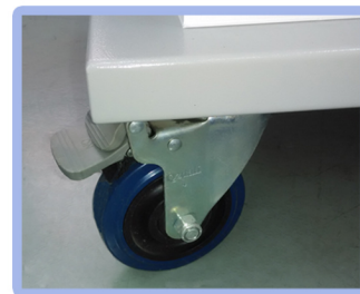
Heavy duty caster