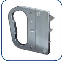
TFMS-TH1 Tool Holder