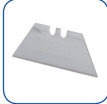
TFMS-UB Utility Blades x 100

Every Trimfast A-Frame Vertical Multi Substrate Cutter includes the TFMS-TH1 Tool Holder and 100 Utility Blades as standard.