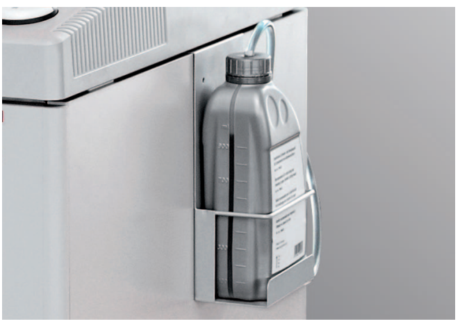
ELECTRONIC OIL INJECTION IDEAL 3105 and IDEAL 4005: the automatic oil injection system lubricates the cutting shafts when shredding and guarantees a consistently high shred performance.