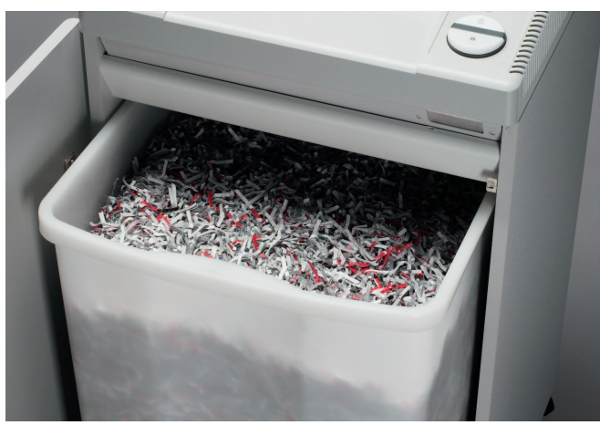
PRACTICAL SHRED BIN The lightweight shred bin made of impact-resistant plastic is easy to handle and can be used with or without a plastic bag.