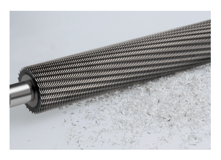
SOLID STEEL CUTTING SHAFTS IDEAL office shredders are available for all security levels of the DIN 32 757 standard. First class quality with special hardened, solid steel cutting shafts. 30 years guarantee on the cutting shafts (except fine cut models).