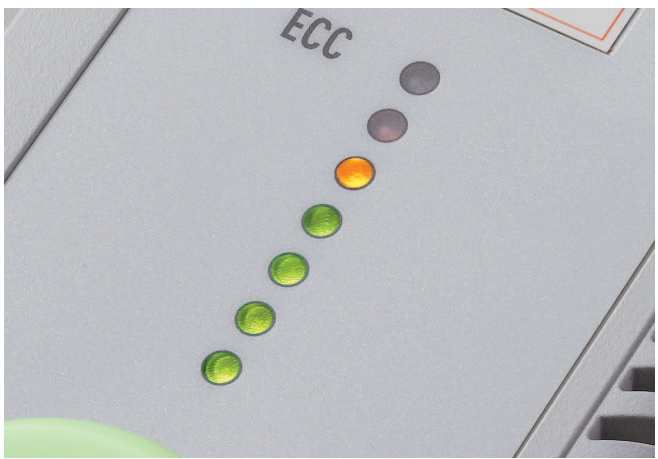
ECC - ELECTRONIC CAPACITY CONTROL ECC - Electronic Capacity Control indicates the used sheet capacity during shredding process to avoid paper jams.