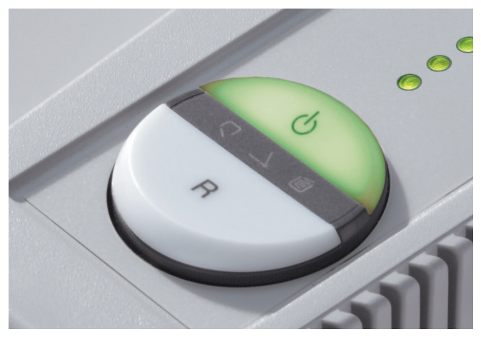
EASY_SWITCH Innovative multifunction control element with integrated optical signals for the operational status.