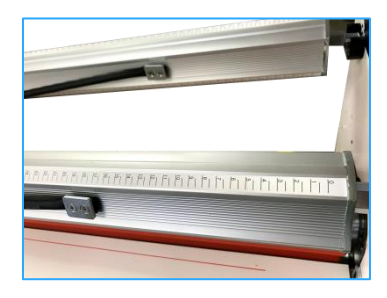
Easy film set new shaft - Light shaft with scale