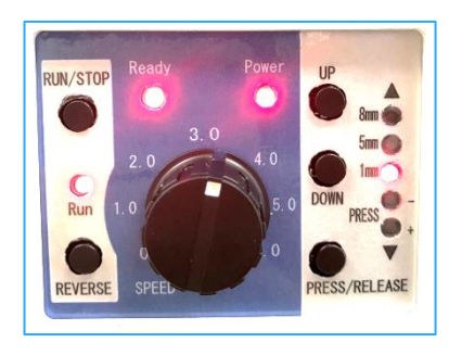
Easy operation panel - Speed/pressure adjustment - Run/stop, reverse mode