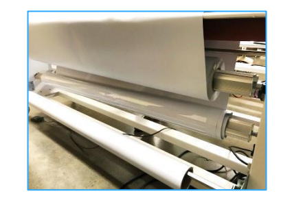
Re-winding system Optional shaft holder