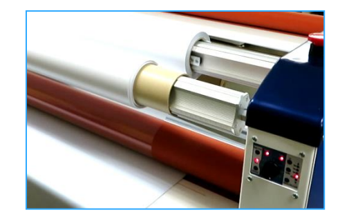
Easy speed adjustment